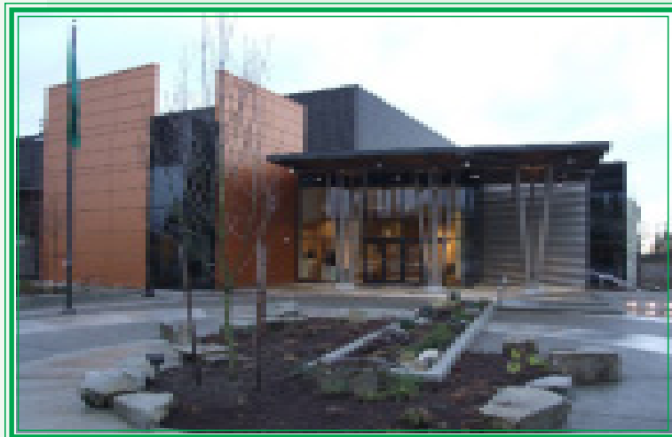
Lynnwood Convention Center

The full Operations and Maintenance Benchmarks research report is available for sale in IFMA's bookstore at www.ifma.org/bookstore . The cost is $60 (U.S.) for the association's members and $120 (U.S.) for nonmembers.