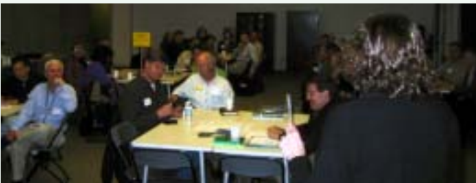
Negotiating w/Difficult People - Sustainability