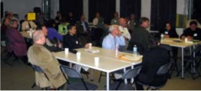
Table Topics: Keeping Clients & Staff Happy