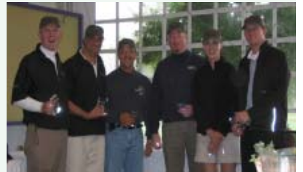
3rd Place Team