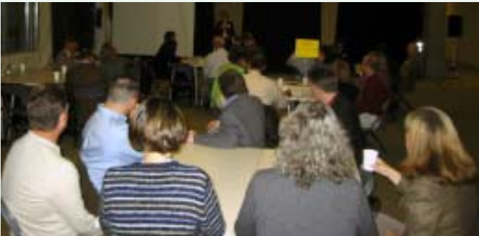
Workplace Injury Prevention - Wireless Phone Technology