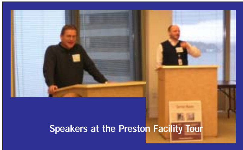
Speakers at the Preston Facility Tour