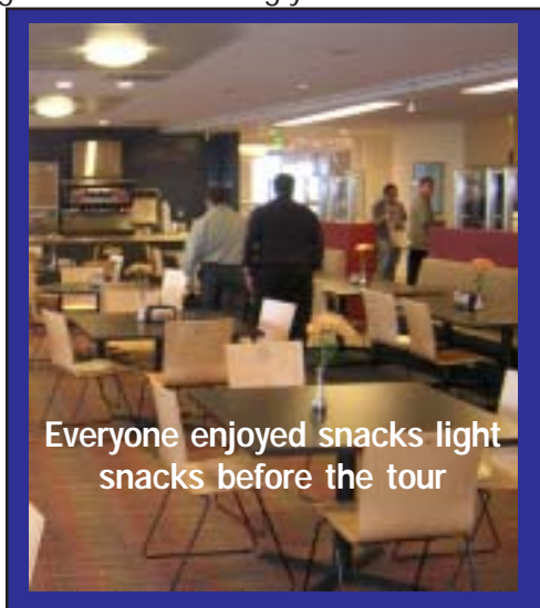
Everyone enjoyed snacks light snacks before the tour