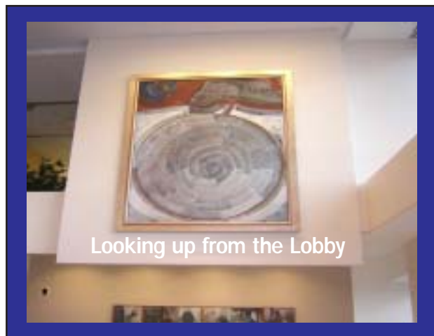
Looking up from the Lobby

Looking forward to seeing you all at the November meeting.