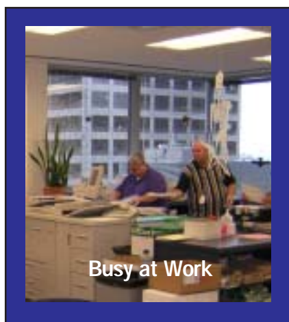
Busy at Work